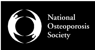
Reversed out of a black solid

If you are unable to use the logo as instructed above you must use one of the examples shown below.