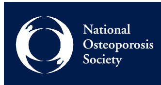
Reversed out of a 281 solid